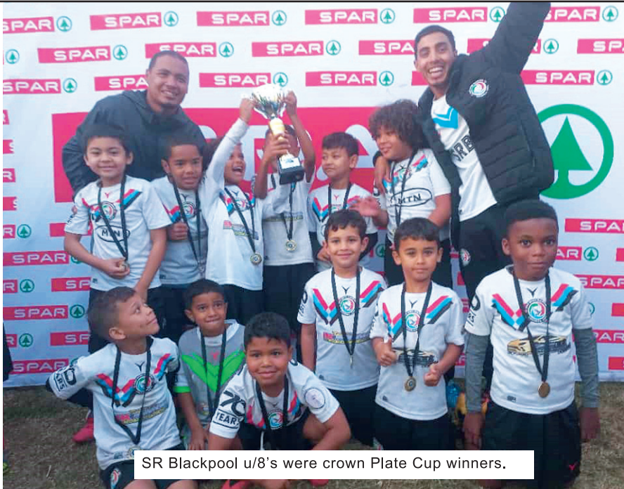
SR Blackpool u/8's were crown Plate Cup winners.