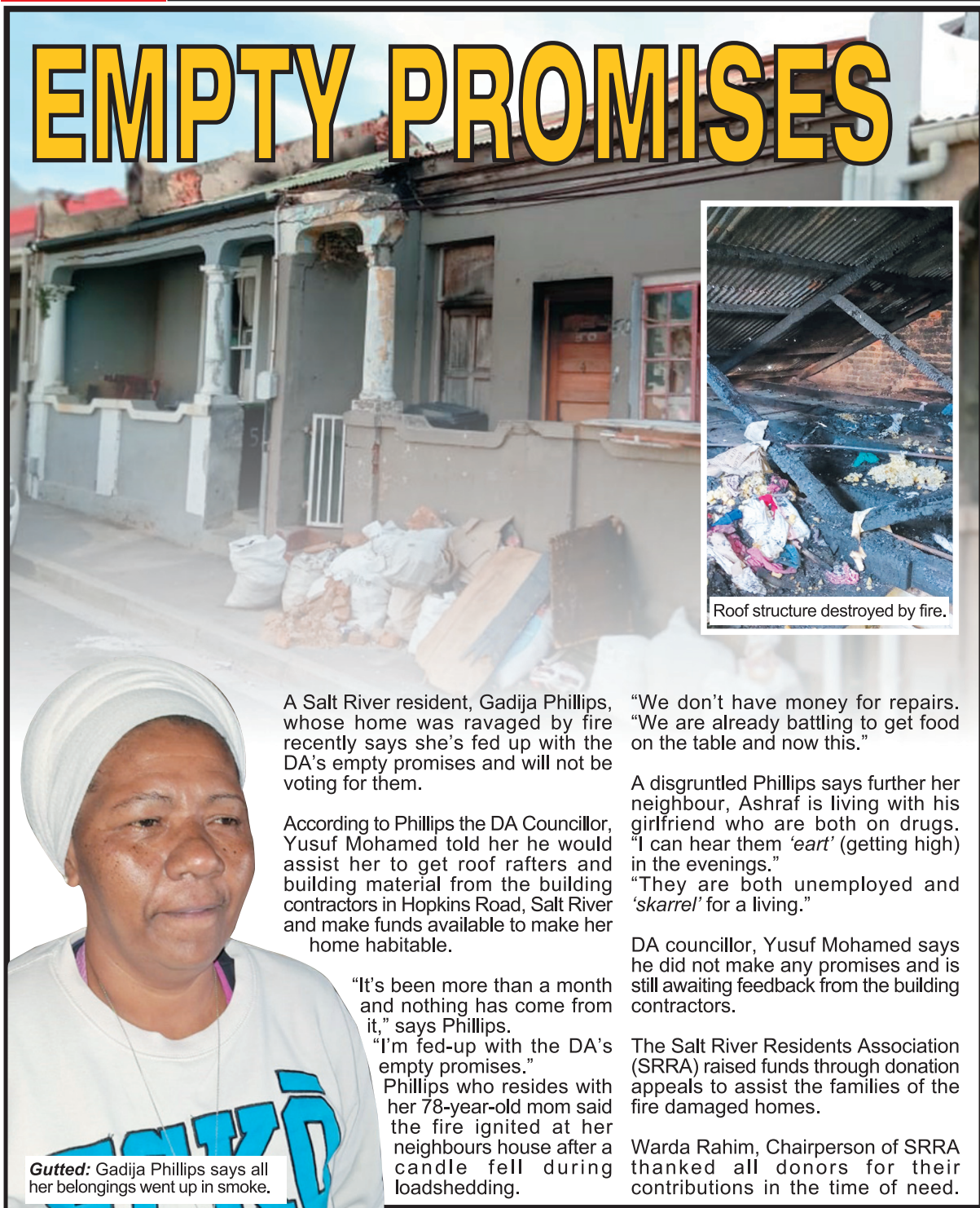
Roof structure destroyed by fire.