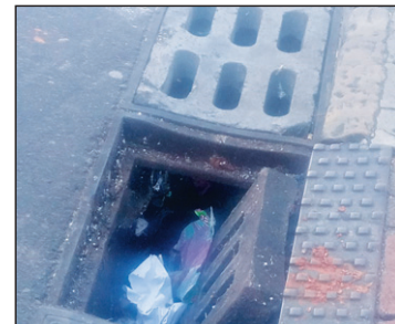
Litter dumps in drains

City contact: 0860 103 089 www.capetown.gov/servicerequests