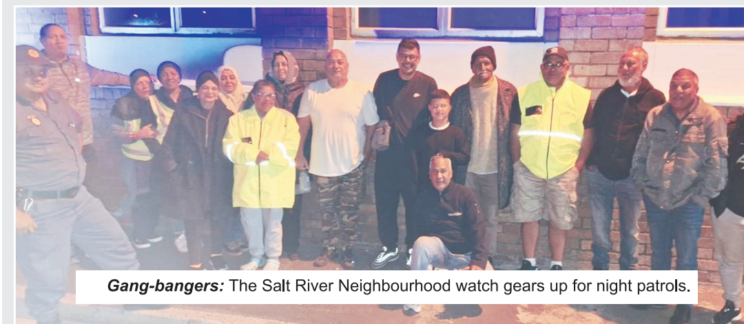
Gang-bangers: The Salt River Neighbourhood watch gears up for night patrols.

Neighbourhood watches from Salt River, Walmer Estate and Observatory met with Community Police Forums and SAPS in a bid to clamp down on gangsters and drugs.